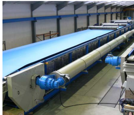
Picture 4: Thanks to its specific mesh design, the VACUBELT® 2015, produced from pure polyester monofilaments, fulfills the strictest requirements for FGDP gypsum dewatering.