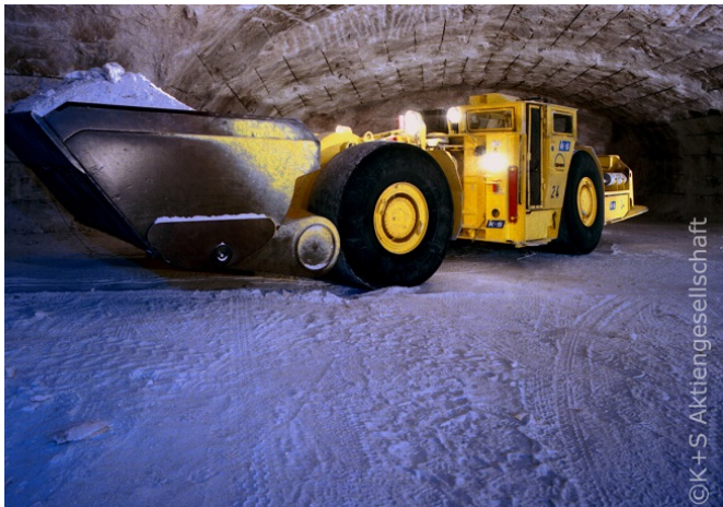
Picture 3: VACUBELT® 5060 filter belts demonstrate their exceptional efficiency in salt dewatering applications.