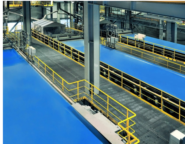
Picture 2: The high-performance VACUBELT® filter belts play a key role for phosphogypsum dewatering. GKD designs and thermally matches these belts individually to the specific phosphogypsum properties, which themselves differ from process to process.